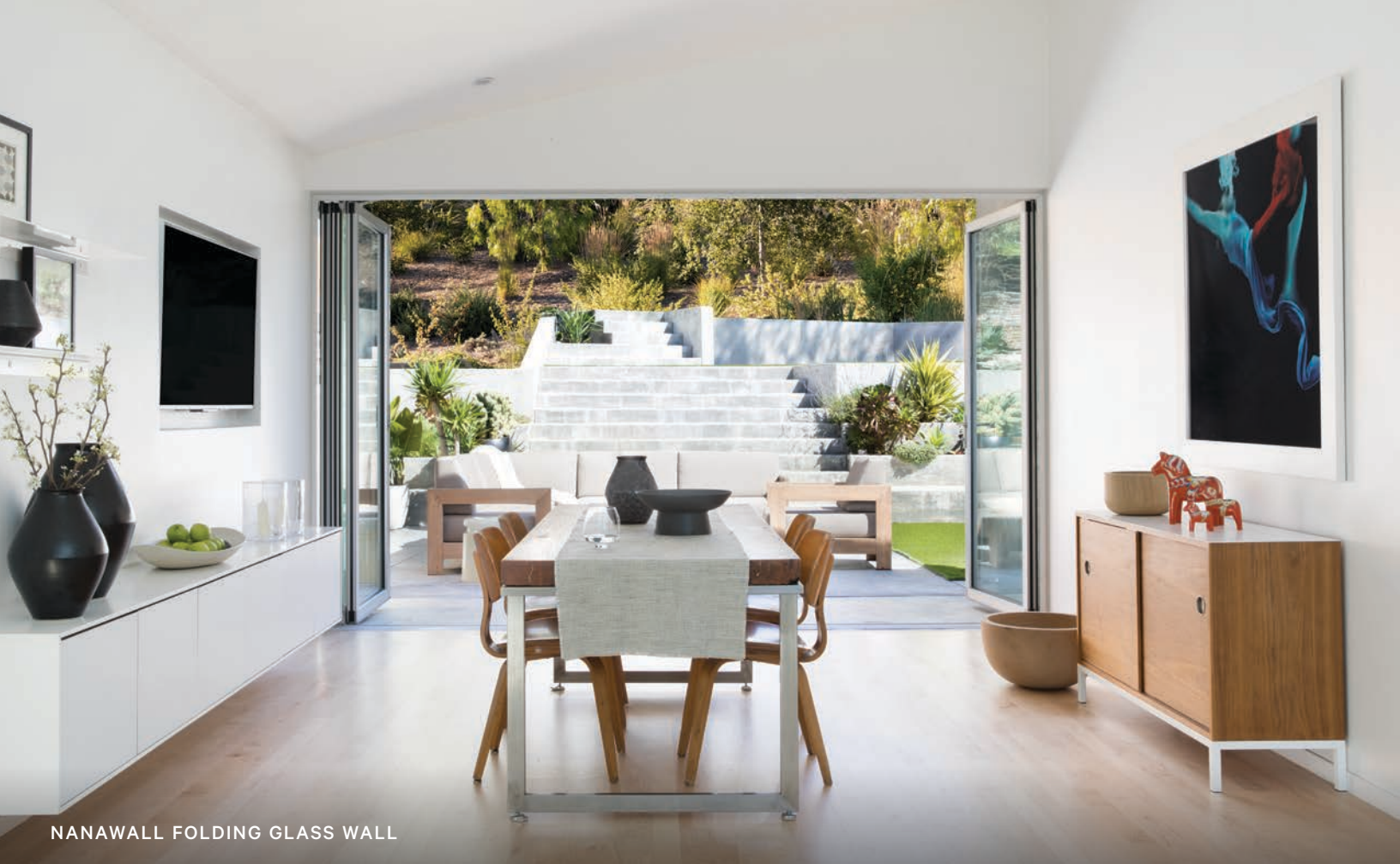
NANAWALL FOLDING GLASS WALL