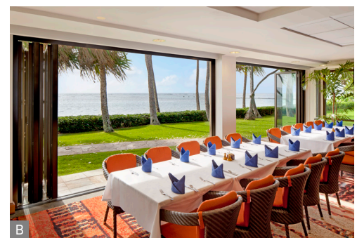
A JW Marriott Scottsdale Camelback Inn Resort & Spa NanaWall Aluminum Framed Folding System SL45 Architect: Architectural Concepts