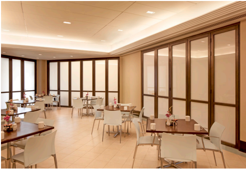
Hyatt Regency Pier Sixty-Six, Ft. Lauderdale FL NanaWall Wood Framed Folding System WD65 Architect: Design Continuum