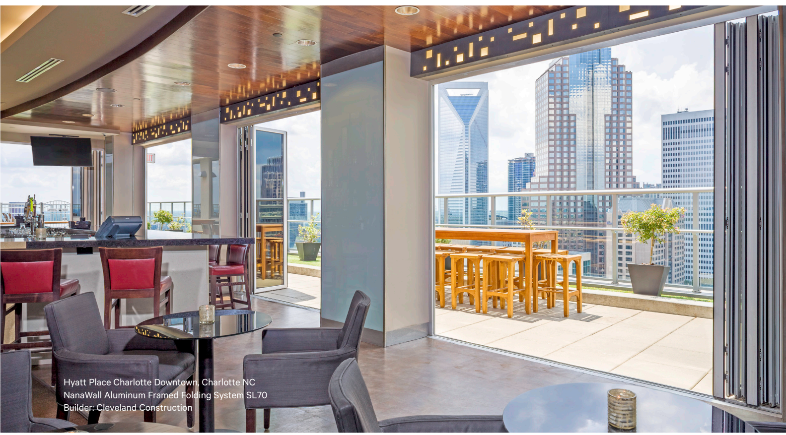
Hyatt Place Charlotte Downtown, Charlotte NC NanaWall Aluminum Framed Folding System SL70 Builder: Cleveland Construction