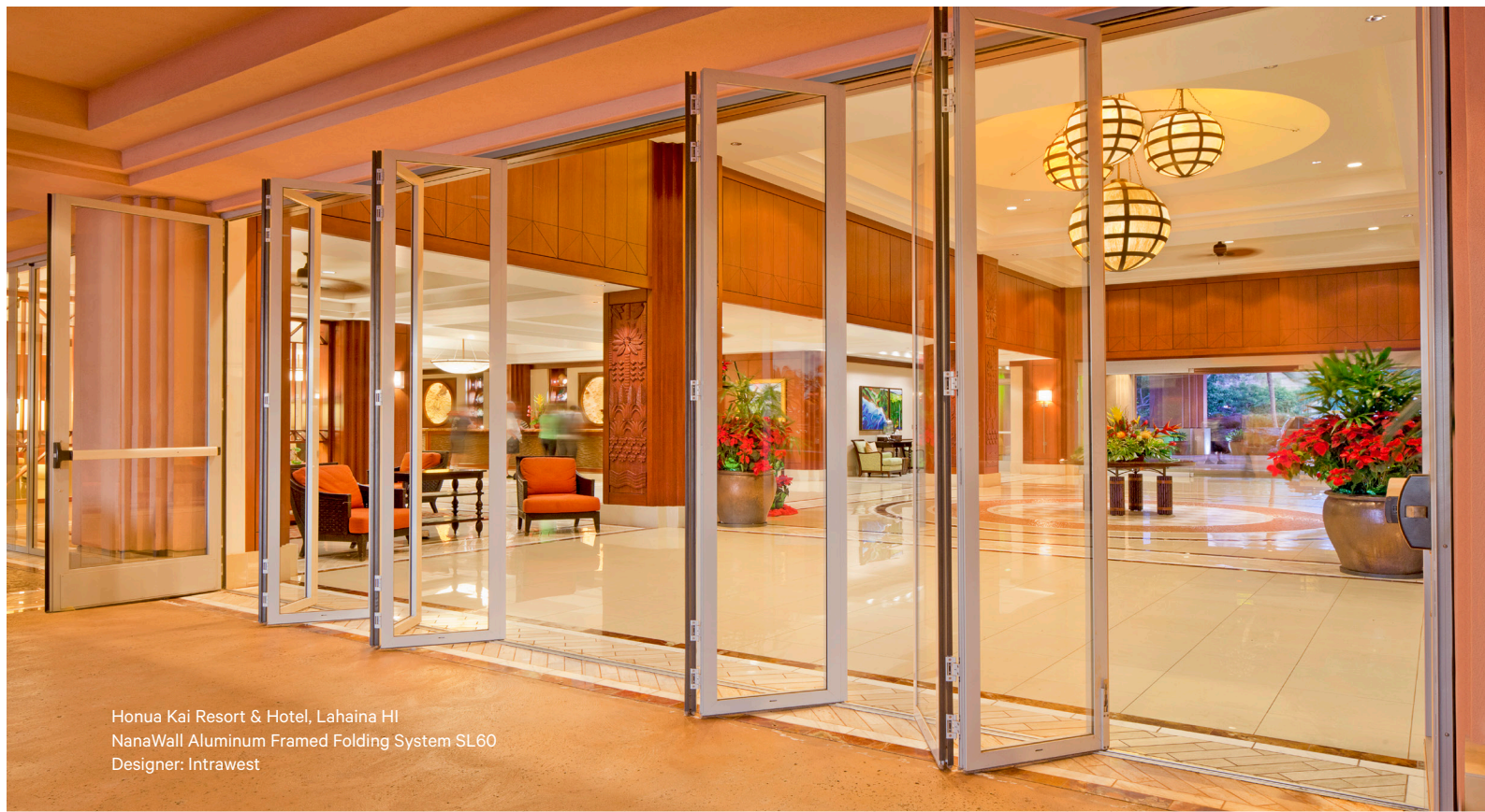
Honua Kai Resort & Hotel, Lahaina HI NanaWall Aluminum Framed Folding System SL60 Designer: Intrawest