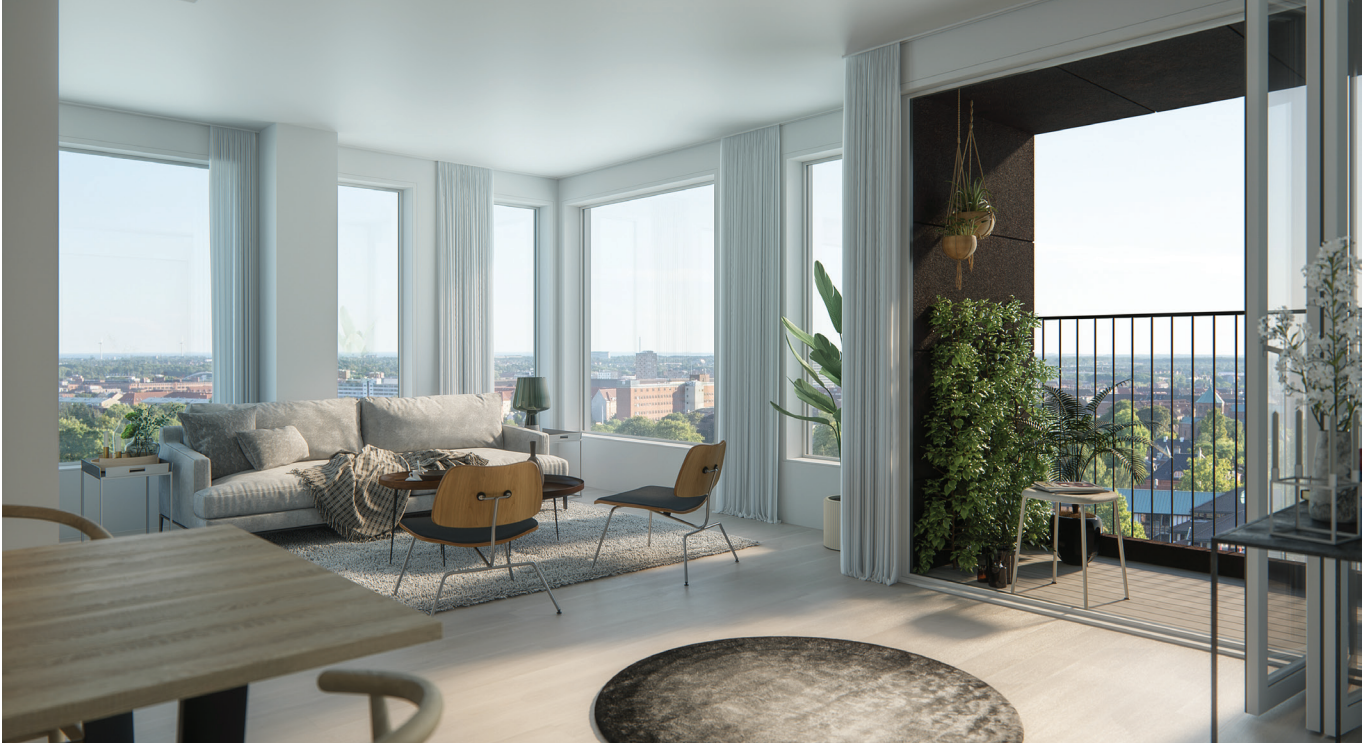
The Danish capital from a lofty perspective: The various pergolas in the Dahlerup Tower, installed at heights of up to 80 metres, provide the perfect view of the city. Animation: Carlsberg Byen/Cadwalk